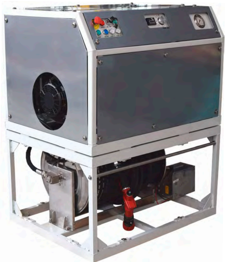
MFU DS in custom colour grey

It is designed for operation by a single person.