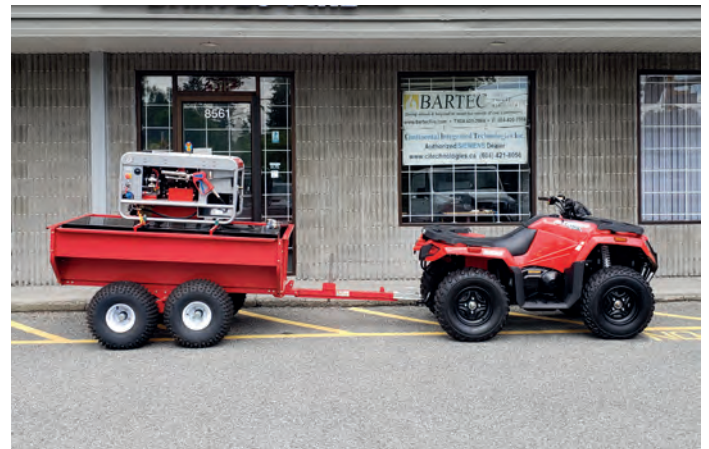
Compact installation on a trailer behind a quad