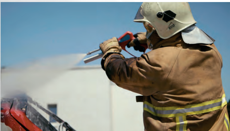
Spray mode of the Barracuda DS

The Barracuda DS can also be used as a cleaning device for large objects or areas. Its high pressure and the option to use different cleaning agents and detergents offer a wide field of use!