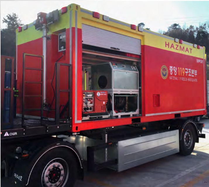
MFU DS used by Korean Fire Department

When pure water is not sufficient, you can use different chemicals for disinfection and decontamination.