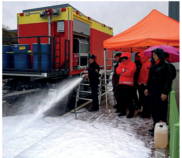
Creating a foam blanket with the MFU DS