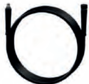
High-Pressure Hose 10m/20m/30m (max. 400 bar)