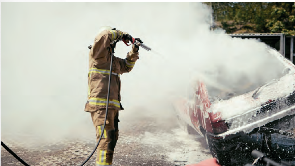
Barracuda DS used for extinguishing a carfire

The controls are designed for easy use by a single person.